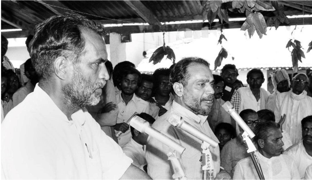
Image: Former Prime Minister of India Chandrashekhar